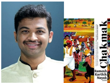
Ramesh Karthik Nayak Poetry Award “Chakmak”